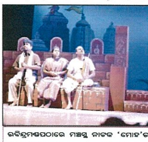
ରାଧିକ୍ରମଣପଦରେ ମଞ୍ଚସ୍ଥ ନାଟକ 'ମୋହର' ଏକ ମନୋରମ ଦୃଶ୍ୟ।

ପୁରୀର ରାଖାଲଙ୍କୁ 'ନାଲ୍‌କୋ ସଙ୍ଗୀତ ସୁଧାକର ବାଳକୃଷ୍ଣ ଦାଶ ସମ୍ମାନ'ରେ ସମ୍ମାନିତ କରାଯାଇଛି। ଏହି ସମ୍ମାନର ଗ୍ରହଣ କରାଯାଇଛି।