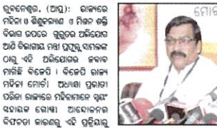
ଏସ୍‌ଏଚ୍‌ଜିରୁ ମୁହଁ ଫୋରାଉଛନ୍ତି ମହିଳା: ବିଜେପି

ଏସ୍‌ଏଚ୍‌ଜିରୁ ମୁହଁ ଫୋରାଉଛନ୍ତି ମହିଳା: ବିଜେପି। ଏହି କାର୍ଯ୍ୟକ୍ରମରେ ମହିଳାମାନଙ୍କୁ ସମ୍ମାନିତ କରାଯାଇଛି।