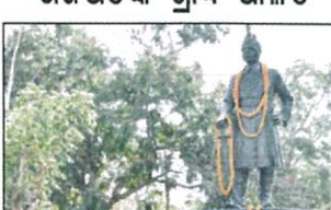
ପାରଳା ମହାରାଜା କୃଷ୍ଣଚନ୍ଦ୍ର ରଜପତିଙ୍କ ଶ୍ରାଦ୍ଧ ପାଳିତ ହୋଇଛି।

ପୁରୀର ରାଖାଲଙ୍କୁ 'ନାଲ୍‌କୋ ସଙ୍ଗୀତ ସୁଧାକର ବାଳକୃଷ୍ଣ ଦାଶ ସମ୍ମାନ'ରେ ସମ୍ମାନିତ କରାଯାଇଛି। ଏହି ସମ୍ମାନର ଗ୍ରହଣ କରାଯାଇଛି।